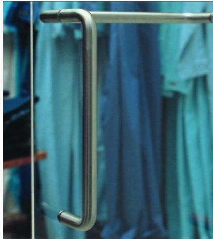
(Shown in 300mm length, three-point fixing.)

Top and side view. For back-to-back fixing, order companion handle 14.4214.02.656. For three-point fixing, order companion handle 14.4218.02.xxx (specify CC measurement). Order bolts and screws separately. For glass application, order Nylon™ washer and sleeve set.